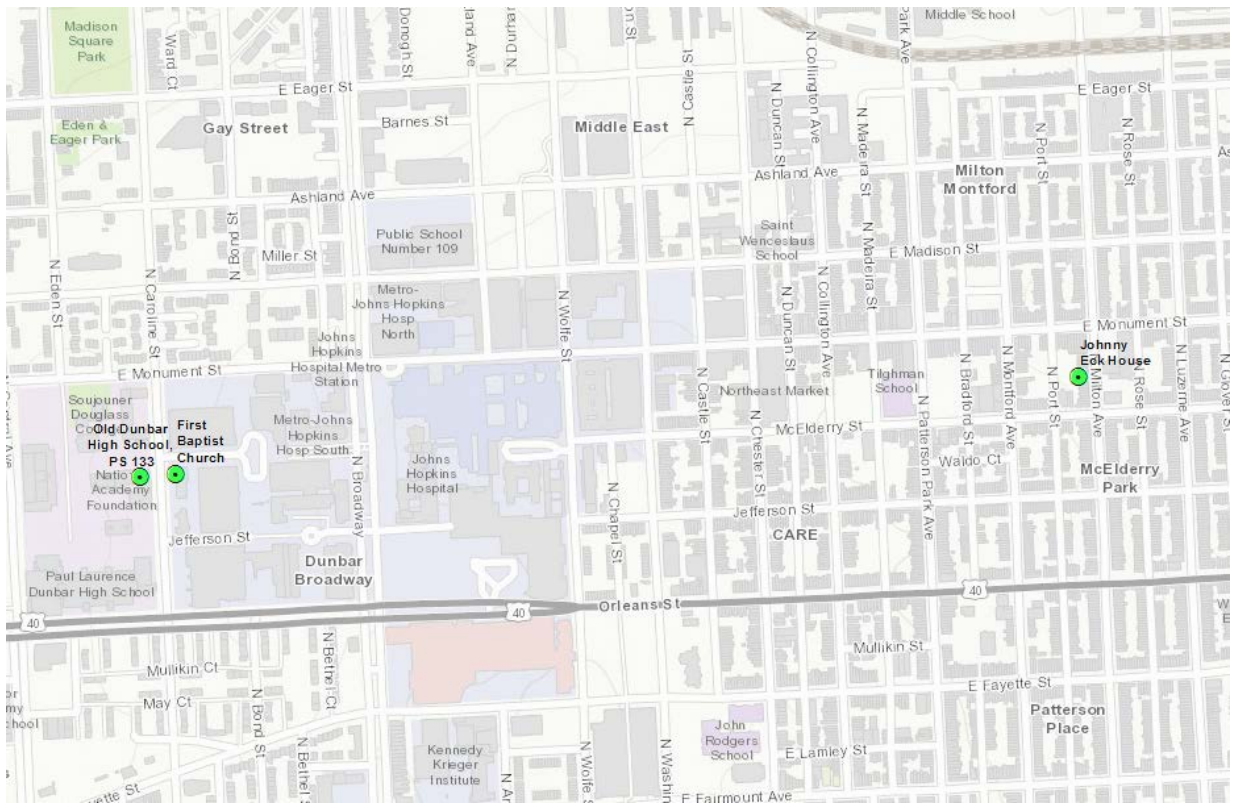
Baltimore City Landmarks in area