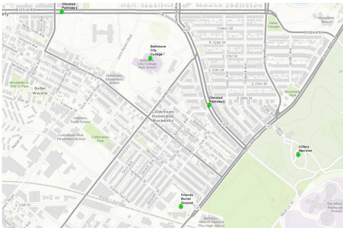
Baltimore City Landmarks in area