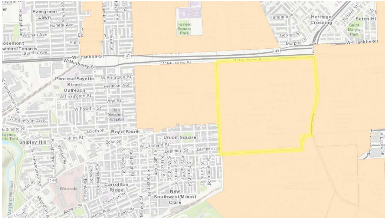
Urban Renewal Plan Boundaries (yellow outline)