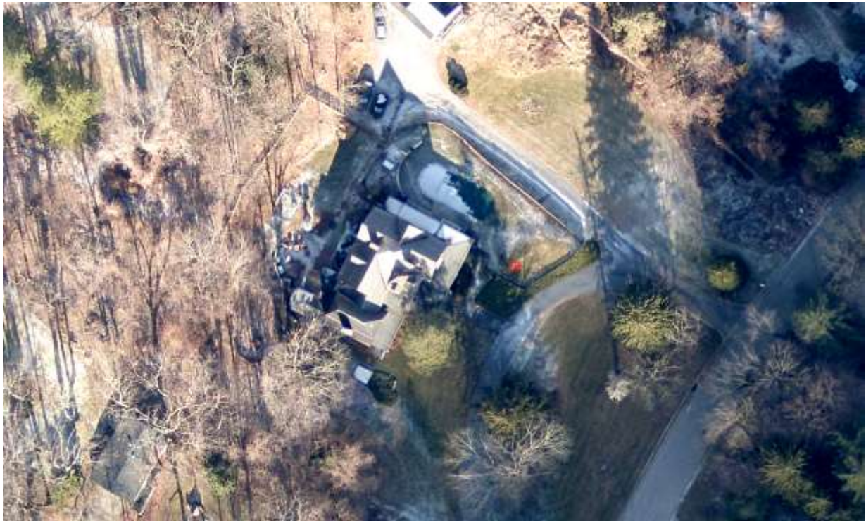
View from the North